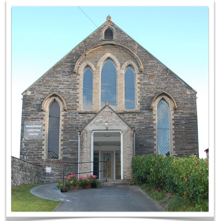
Registered Charity Number 1050242

www.wadebridge-exchange.org.uk bookings@wadebridge-exchange.org.uk