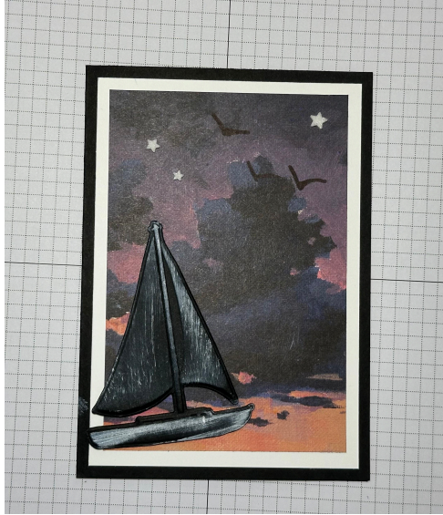
Alternative using DSP