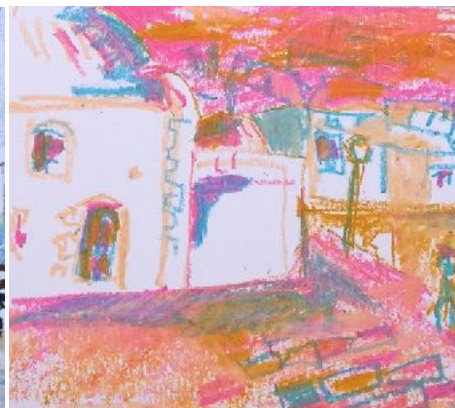
participants artwork from workshop May 2015