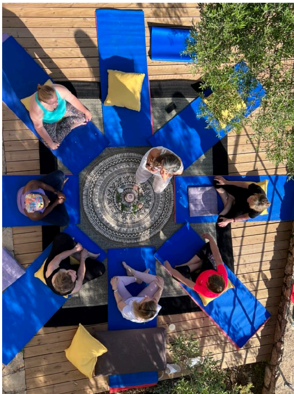
morning yoga from retreat May 2022