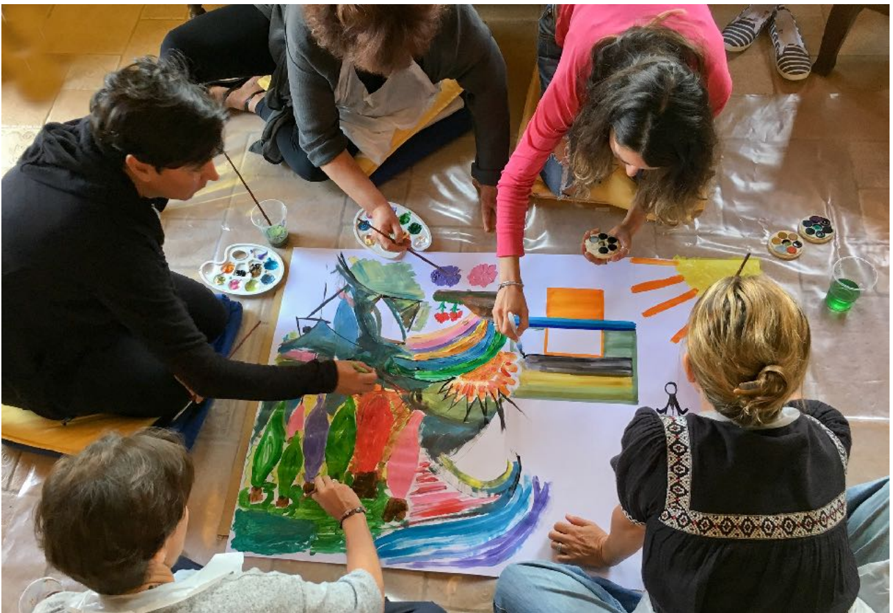
group artwork from retreat October 2017

This retreat is not about mastering artistic skills is about using art to express freely, gain insight and experience self development. Participants on the retreat hail from many countries and often different continents enriching the cultural diversity of groups and making them more fun and interesting.